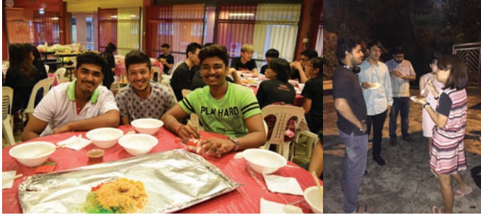
Chinese New Year Celebration

Hostelites can look forward to a monthly gathering that aims to engage and integrate them into the PSB Academy community.